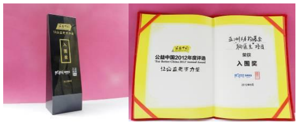
Trophy and certificate

Media report (in Chinese): http://www.p5w.net/news/cjxw/201209/t4498983.htm