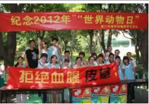
The activity in Xiamen attract over 10,000 visitors